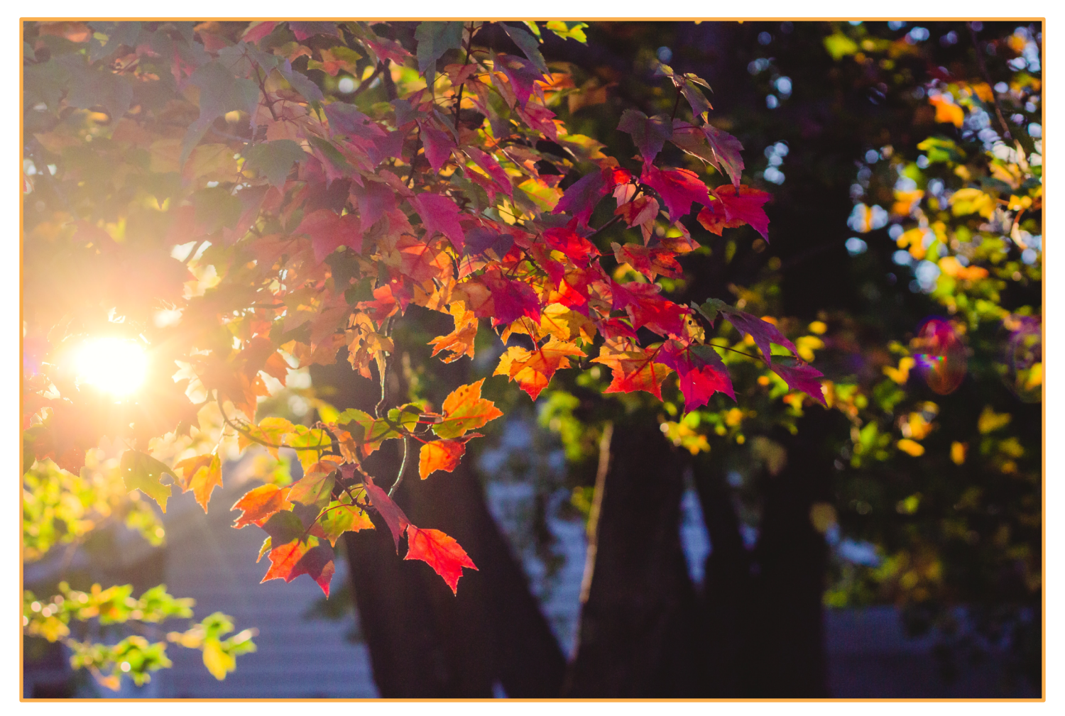
March 15, 2022